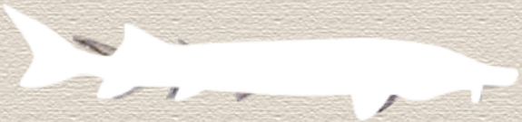
Atlantic sturgeon ( Acipenser o. oxyrinchus )