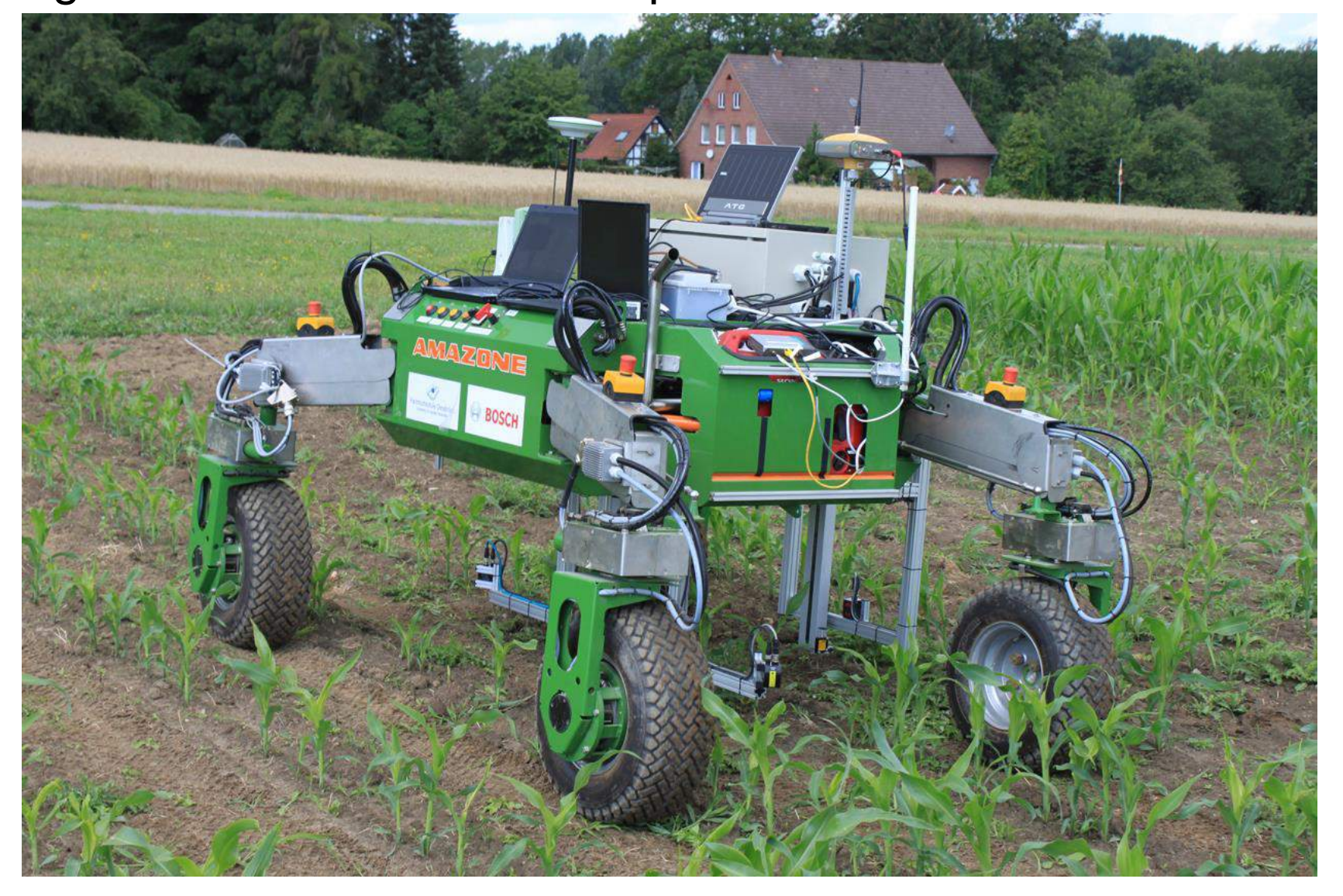
Robot "BoniRob" by Amazone and Bosch