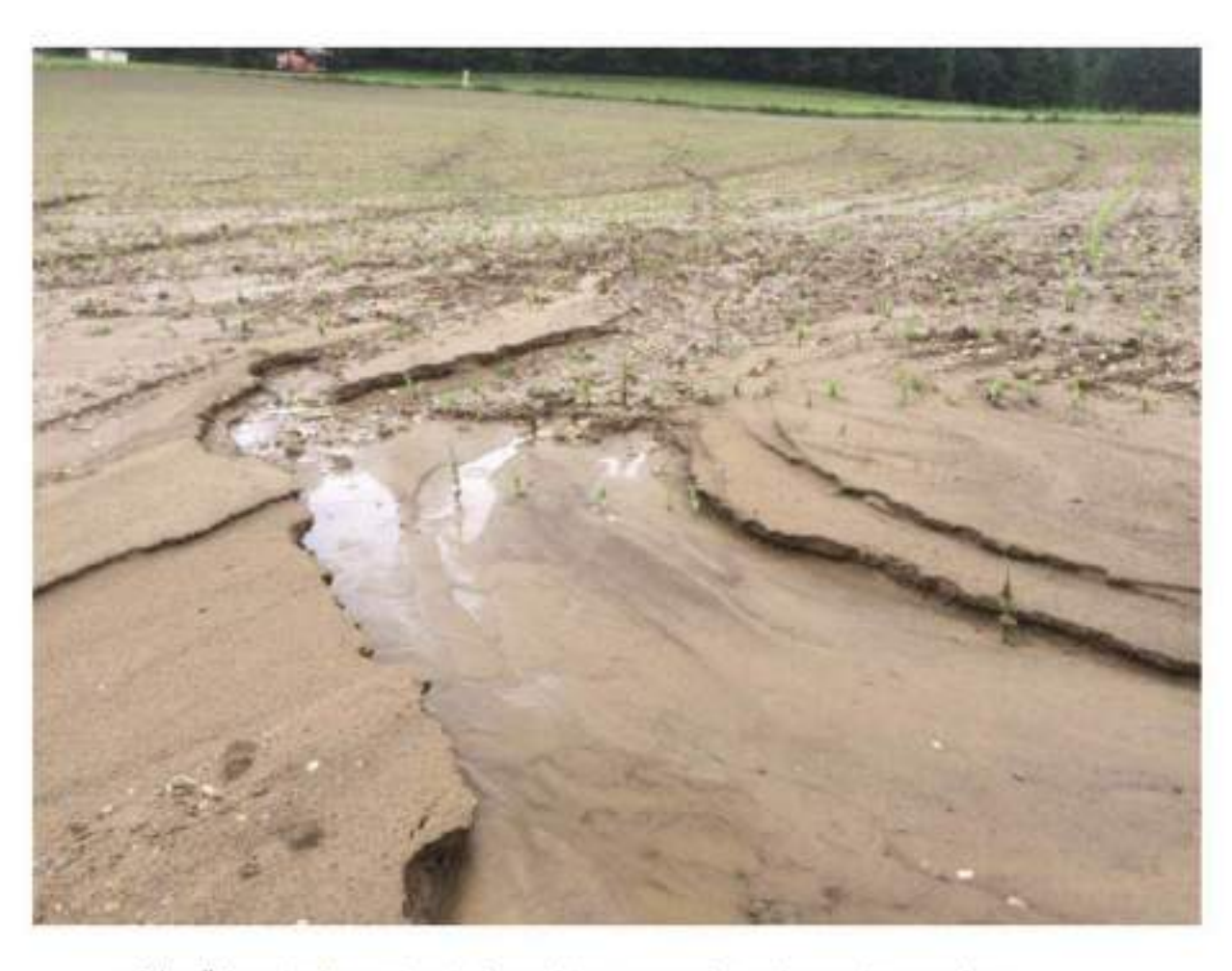
Auf den Äckern in der Region sind gewaltige Spuren der Bodenerosion zu sehen.