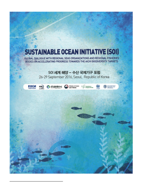
[1] https://www.cbd.int/doc/meetings/mar/soio m-2016-01/official/soiom-2016-01-outcome-en.pdf